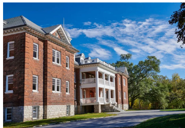
Figure 1. Mohawk Institute and Woodland Cultural Centre, Six Nations of the Grand River, Brantford

From the beginning of the WCC being open, ownership, operational and governing stability were routinely pressured by community and board conflict. The Mohawk Chapel believed that they held personal ownership of the school for some time. Additional risks and challenges ranged from funding to the collection of cultural artifacts and training Indigenous personnel. A difficult period of financial loss came “in 1986, [when] the Board of Governors decided to implement its long-term plan to upgrade and increase the physical plant and secured funding to add on a large orientation room. Although at this time it was also apparent financial restrictions were beginning to hamper program development and delivery.” 5