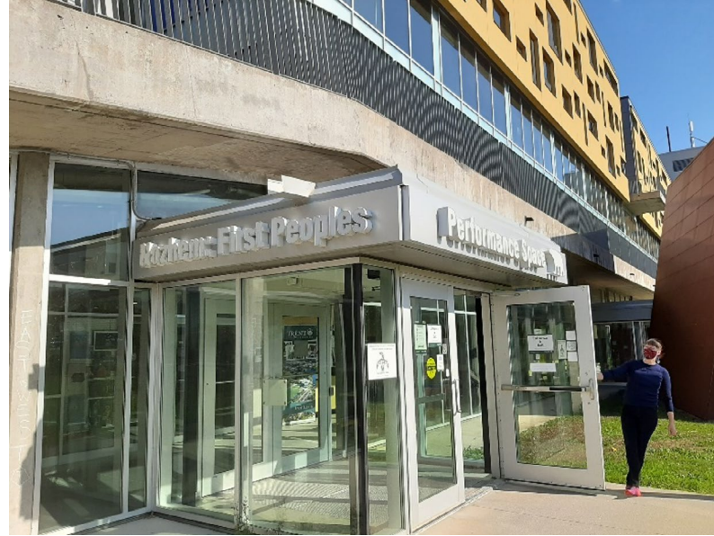
Figure 5. Nozhem: First Peoples Performance Space, Trent University, Peterborough

Architectural drawings then came forward for a First Peoples House of Learning and Humanities Centre and a First Peoples' Performance Space as part of the goals for the ongoing funding campaign. Both additions would be part of the new Enwayaang