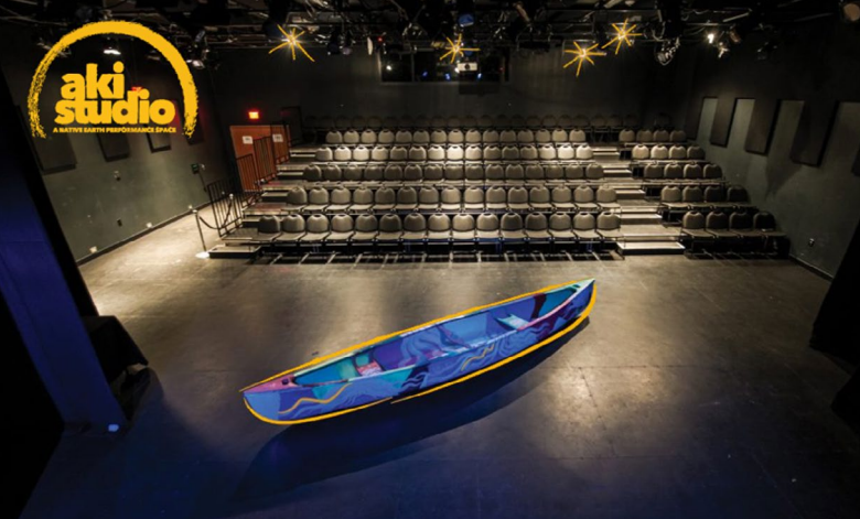
Figure 3. Native Earth Performance Space's Aki Studio, Toronto