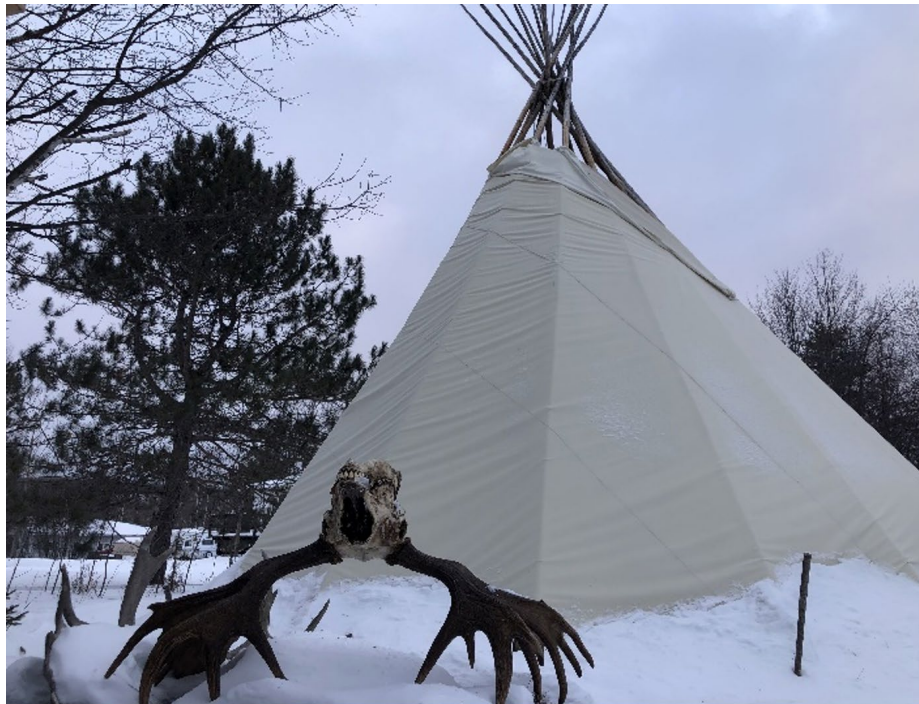
Figure 6. Aanmitaagzi and Big Medicine Studio, Nipissing First Nation, North Bay