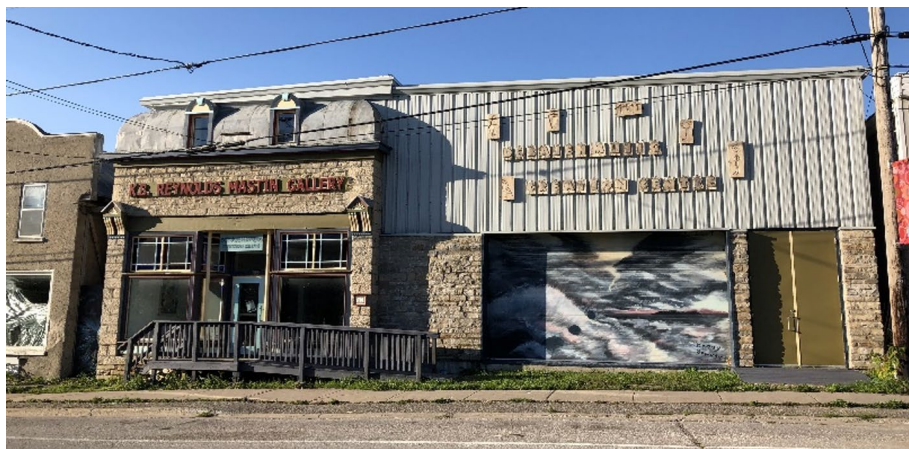
Figure 4. Debajehmujig Creative Centre, Manitowaning, Manitoulin Island

The Creative Centre consists of a black box theatre, a soundproof recording studio, gallery space, a store, a digital lab, various break out rooms and offices, as well as a multi-purpose room and adjacent kitchen. “This is where a lot of magic happens: greeting people and sitting down at the table to be more comfortable. We have our staff meetings here and all our meals come out of here. So, this is our board table. ... our staff worked at [carving] the sacred teachings [into the table]: the cycles of the moon, morning and night, and the seasons. Those are really what time is; a story about your freedom, freedom of choices; we have our diamond teachings; We talk about being sustainable and... thinking about the future, not taking more than we need, but making sure that everybody has the ability to build, plant, harvest. You don’t have to rely on anybody else if you know how to do those kinds of things. This is about ceremony; the preservation of humanity, and we make sure we are coming together in a good way.” 13 At present Debaj continues to maintain their main headquarters in a portable trailer, on reserve at 8 Debajehmujig Lane in Wiikwemikong while still performing at the Ruins, and hosting all of the operations out of the Manitowaning Centre.